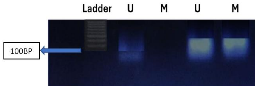
Figure 2: Lane No- 1 represents molecular marker; Lane No-2,4 represents Unmethylated bands; Lane No- 3,5 represents Methylated bands.

The result of MS PCR was obtained to evaluate the hypermethylation status of MSP. It was performed to assess the promoter hypermethylation status of the p15 gene in patients with Oral Squamous Cell Carcinoma (OSCC) within the North Indian population. In some samples both Unmethylated and Methylated bands were obtained, the reason could be mixed populations of normal and cancerous cells as shown in Figure 2 .